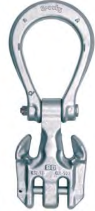
A-1362 Double Hook