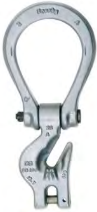
A-1361 Single Hook